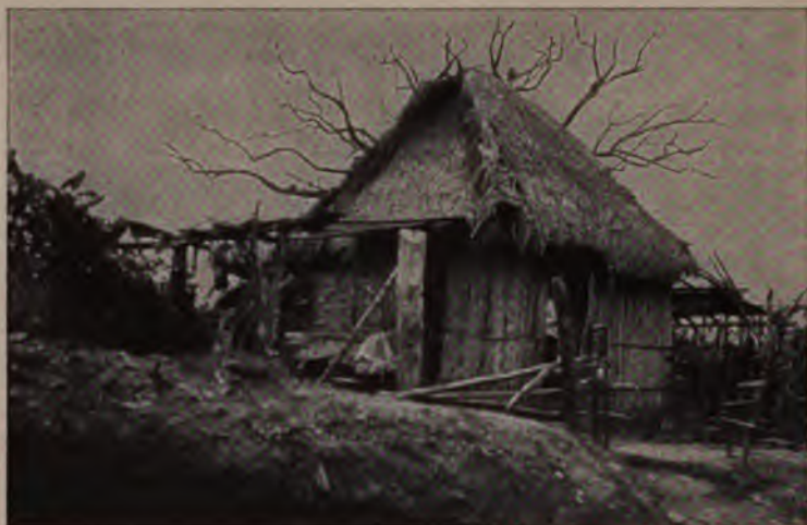
A dwelling in "the bush"